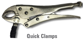
Quick Clamps Part Number: 4023333